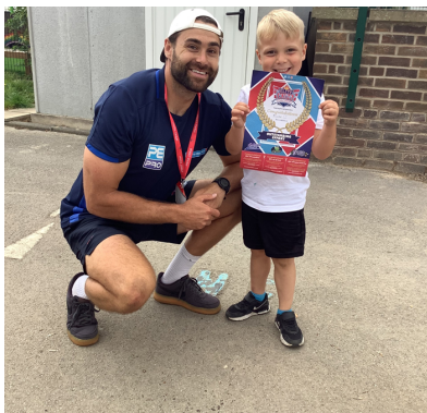
Rabbits enjoyed their first PE session with Elite Kids Coaching.