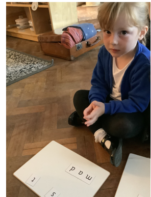
Badgers have been practising their blending skills.