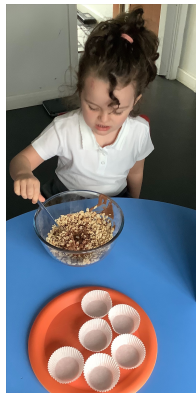
Squirrels have been baking.