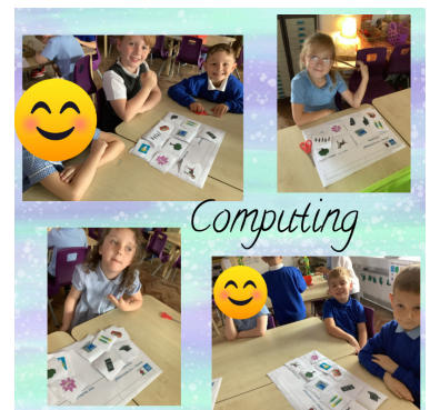
This week Foxes have started their computing learning by sorting.