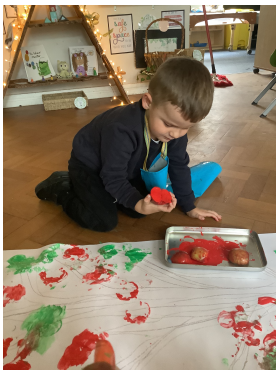
Hedgehogs have been learning all about apples as part of the Wanderlust Nature Study.

Here are some photos of what has taken place in each class this week: