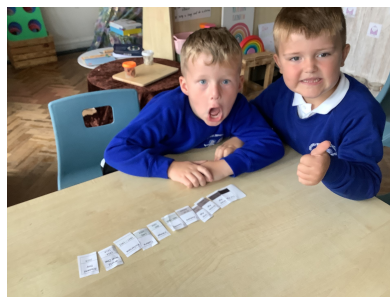
Otters have been historians, practising sequencing events into chronological order.