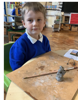
Badgers have been learning about local artist, Barbara Hepworth. They have created their own sculptures.