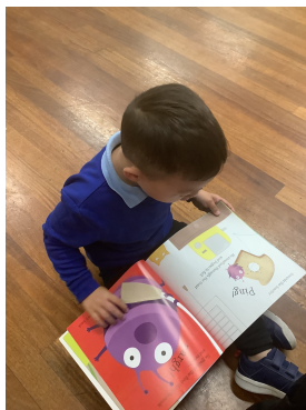
Hedgehogs enjoyed their school library session.

Here are some photos of what has taken place in each class this week: