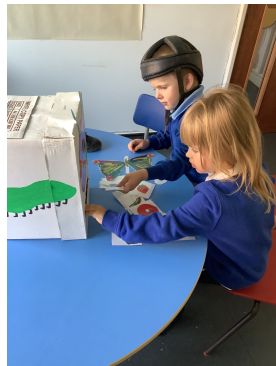
Children accessing squirrels used their fine motor skills to feed the hungry caterpillar.