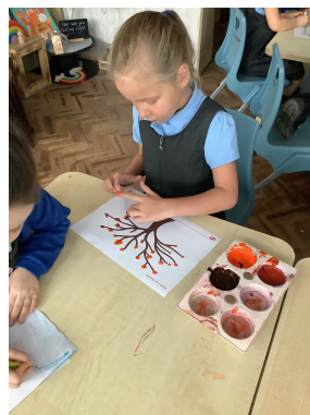
Otters have been learning about Harvest and making autumn artwork