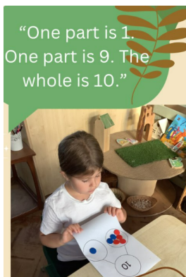
Rabbits have been practising partitioning quantities using a part whole model.